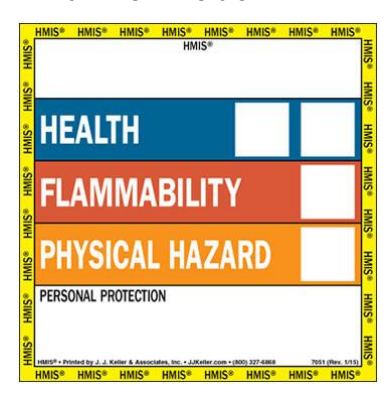
HMIS - New Version

employees in the workplace of associated hazards. The NFPA (National Fire Protection Association) fire diamond label is intended for emergency response personnel and are placed in all areas where fire hazards exist. Both labeling systems must be consistent with OSHA's revised Hazard Communication Standard 2012, which is currently in alignment with the new Global Harmonization Standard (GHS).